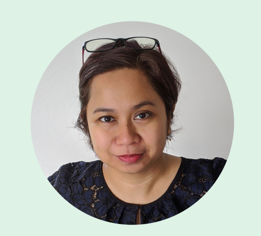
Editor APCEL NUS Law/ Universitas Gadjah Mada