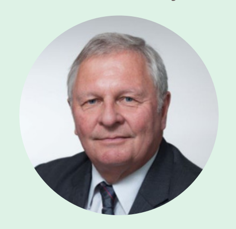
Judge Laurie Newhook Former Chief Environment Court Judge, Environment Court of New Zealand