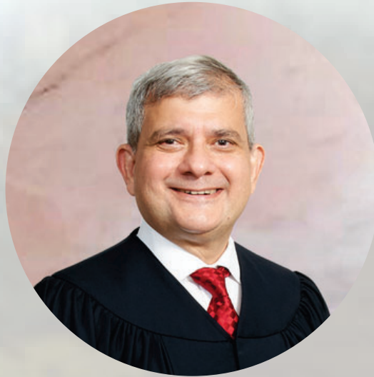
Justice Philip Jeyaretnam (Supreme Court of Singapore)