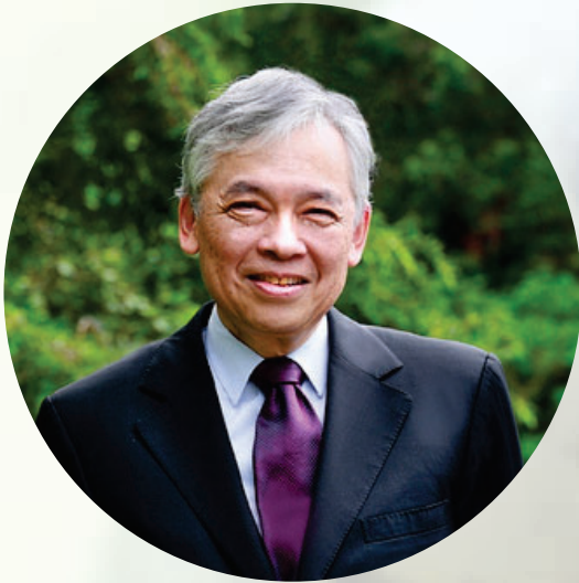
Justice Anselmo Reyes (Singapore International Commercial Court)