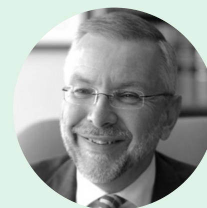
Justice Brian Preston Land and Environment Court of New South Wales