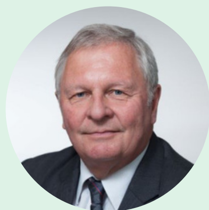
Judge Laurie Newhook Former Chief Environment Court Judge, Environment Court of New Zealand