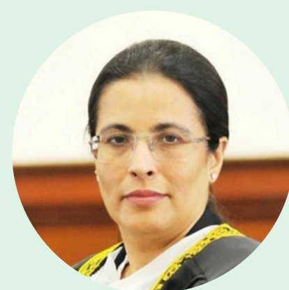
Justice Ayesha Malik Pakistan Supreme Court