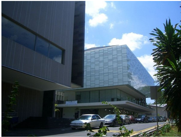
Entrance to Main Lobby of Block B