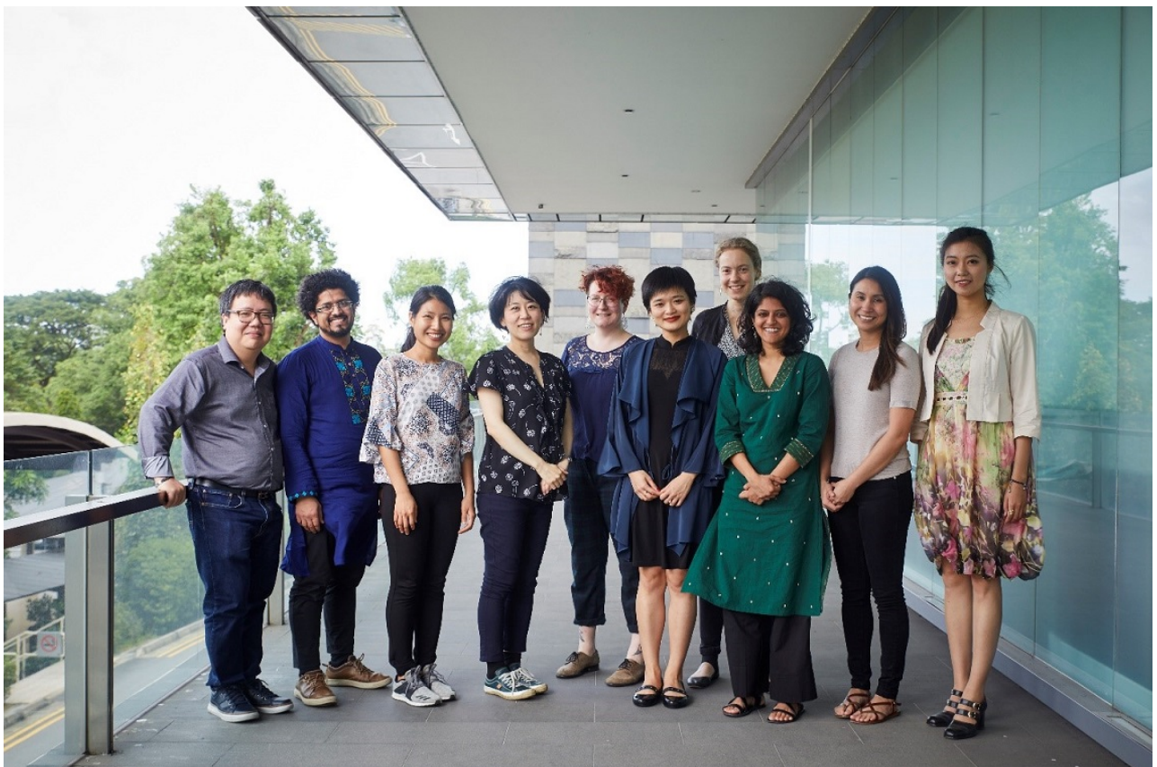
TRIALS Workshop 1 Participants