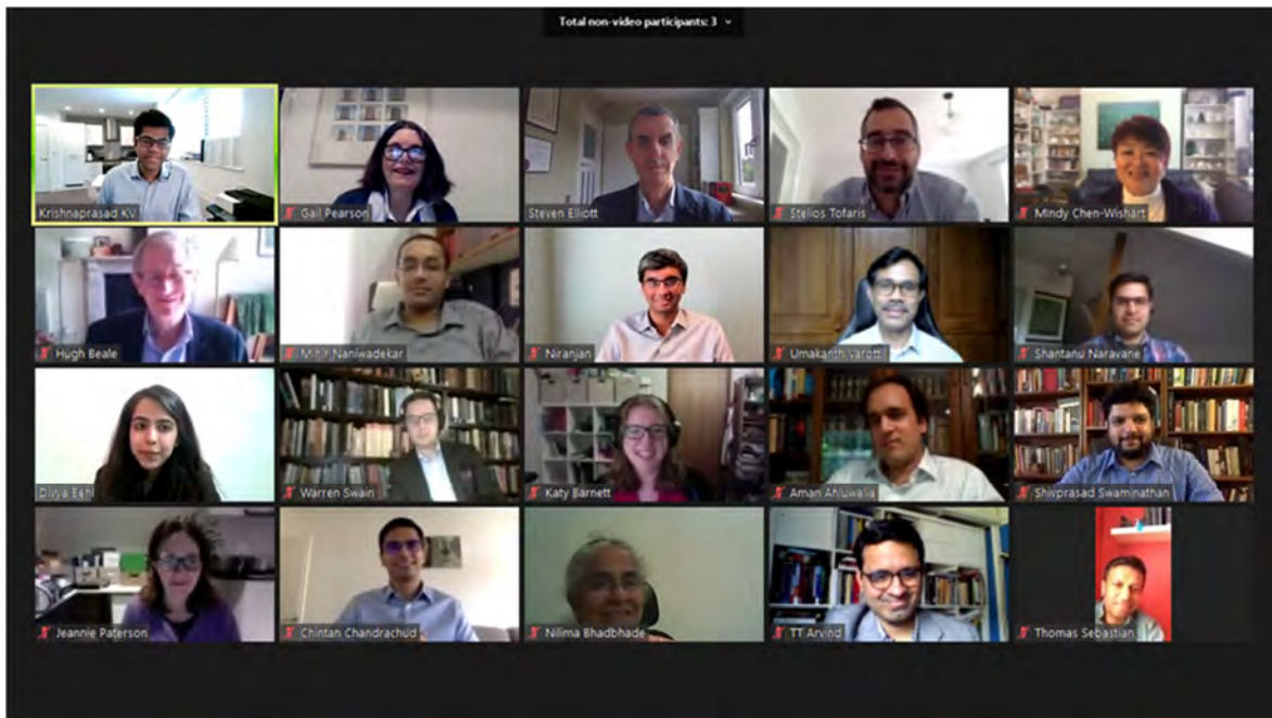
Participants at an online session on '150 Years of The Indian Contract Act 1872'

In 2022, the Indian Contract Act will turn hundred and fifty years old. Yet, there is a striking dearth of critical academic scholarship on the Act. This project attempts to address this. It aims to produce, in collaboration with academics and practitioners from around the world, an authoritative commentary on Indian contract law.