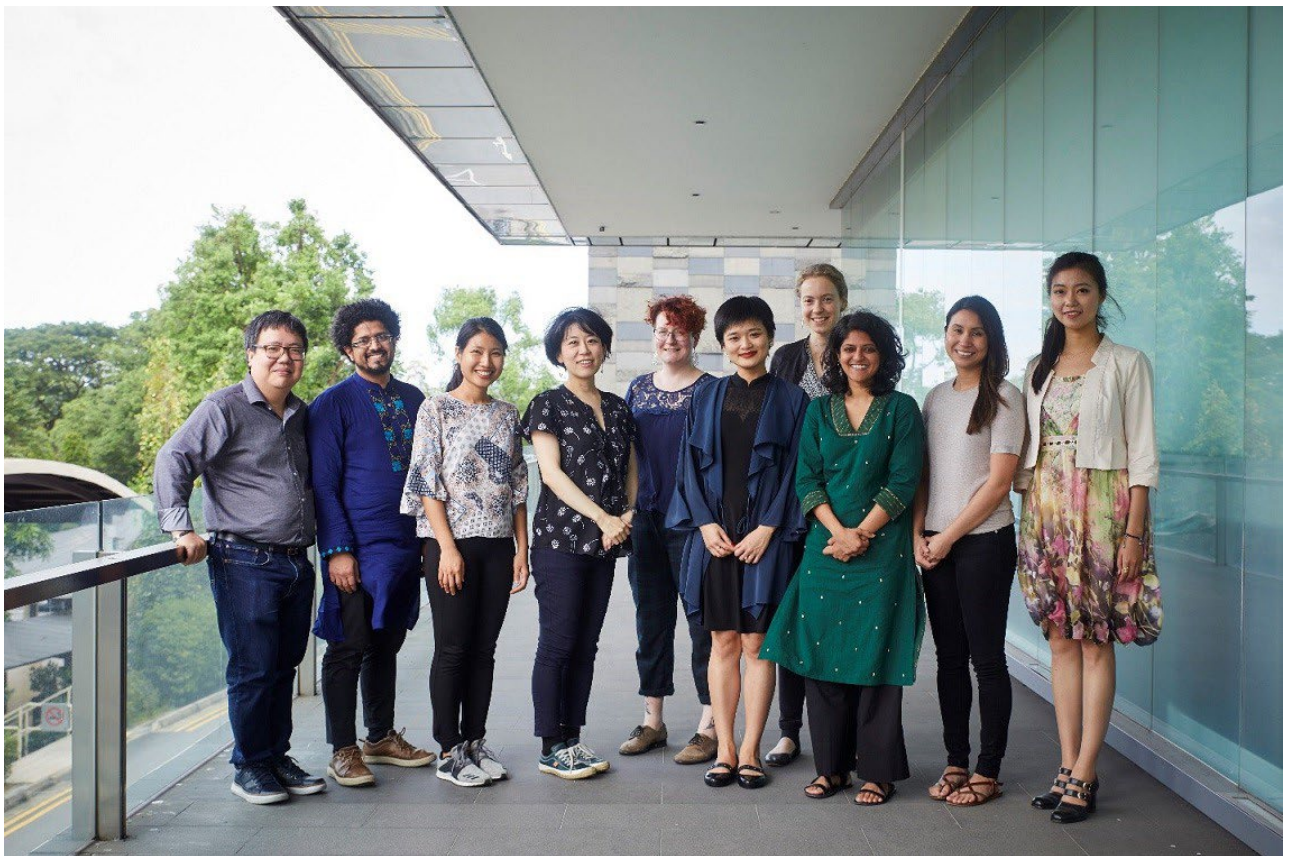
TRIALS Workshop 1 Participants