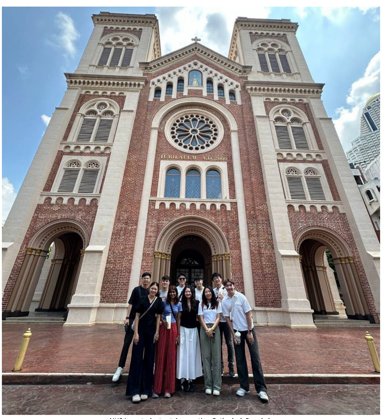
NUS Law students at Assumption Cathedral, Bangkok.