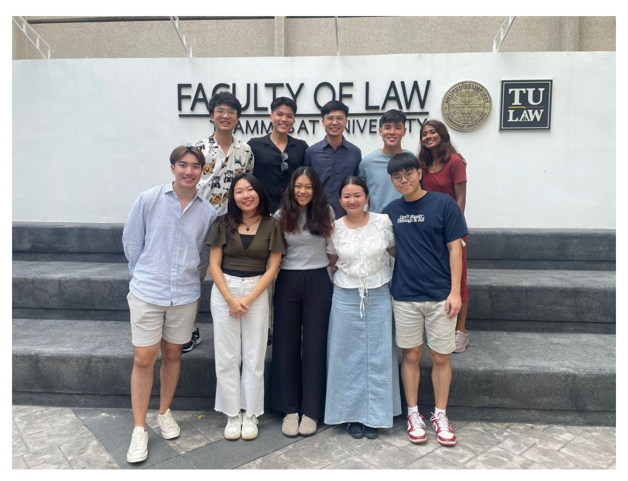
NUS Law students exploring the beautiful Tha Prachan Campus.

The opportunity to experience Thai culture and history firsthand was eye-opening. I am also deeply appreciative of the TUCLS members, who eagerly took on the role of our guides. Their enthusiasm in sharing their heritage with us made the experience more meaningful, and we truly enjoyed learning from them.