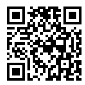
Closing date: Wednesday, 28 February 2018

Limited Seats! Register at <a href="https://tinyurl.com/LunchseminarMAR7">https://tinyurl.com/LunchseminarMAR7</a>