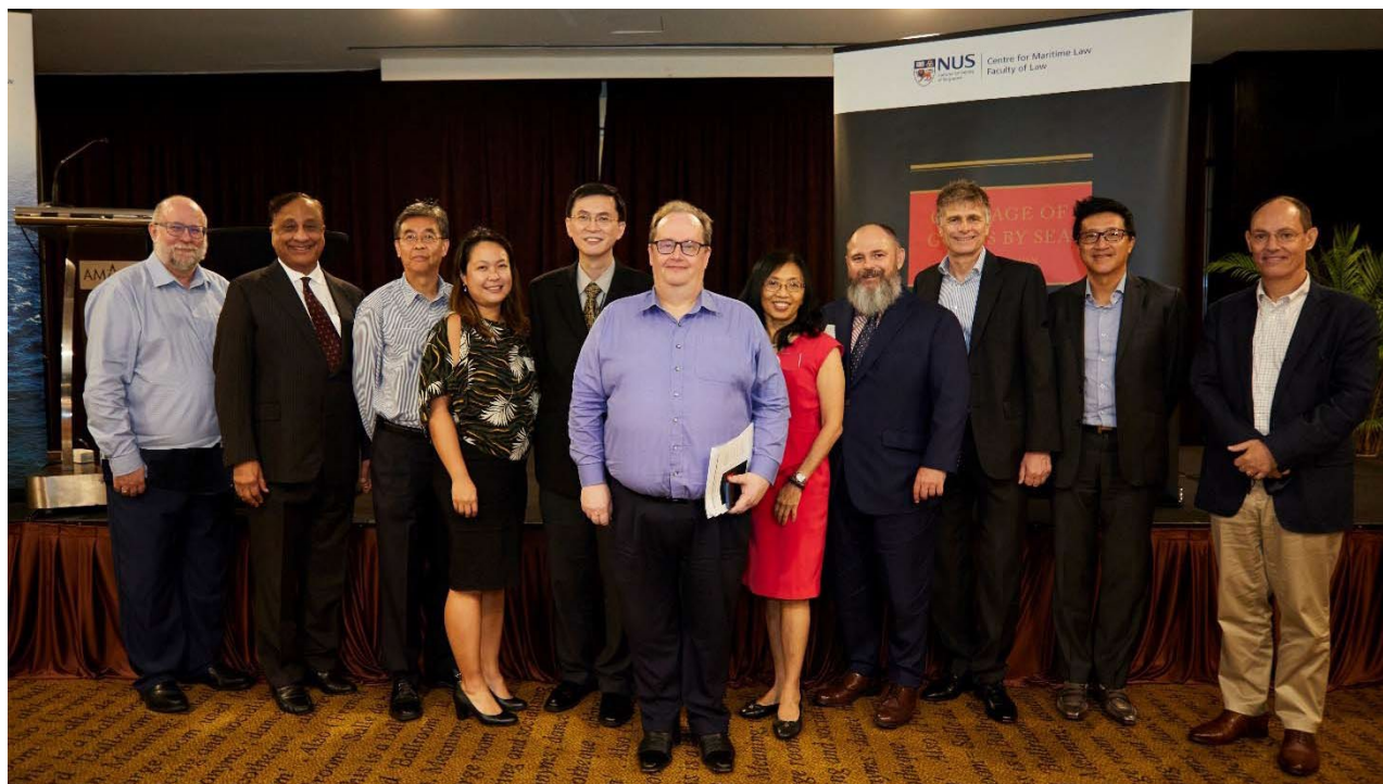
CML leadership and our Advisory Board members