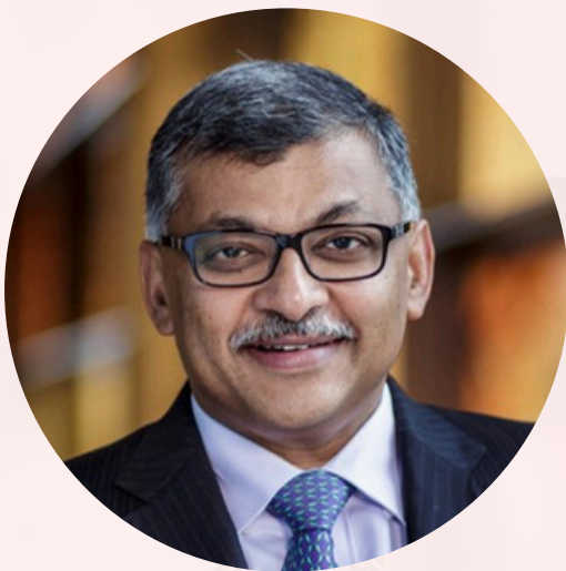
CHIEF JUSTICE SUNDARESH MENON SUPREME COURT OF SINGAPORE

Chief Justice Sundaresh Menon was appointed Chief Justice of the Supreme Court on 6 November 2012.