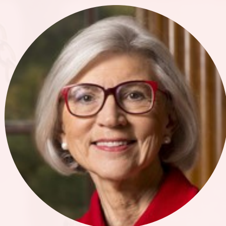
THE RIGHT HONOURABLE BEVERLEY MCLACHLIN, P.C., C.C. FORMER CHIEF JUSTICE OF THE SUPREME COURT OF CANADA

THURSDAY, 22 JANUARY 2026 || 5.00PM TO 6.40PM || THE WESTIN SINGAPORE