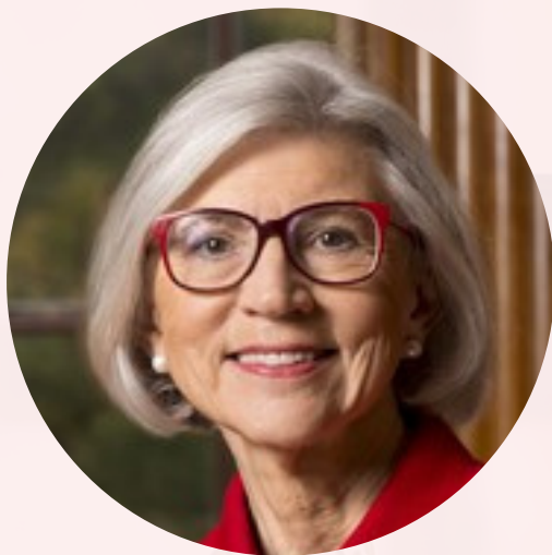
THE RIGHT HONOURABLE BEVERLEY MCLACHLIN, P.C., C.C. FORMER CHIEF JUSTICE OF THE SUPREME COURT OF CANADA

The Right Honourable Beverley McLachlin spent her formative years in Pincher Creek, Alberta and was educated at the University of Alberta, where she received a B.A. (Honours) in Philosophy in 1965. She pursued her studies at the University of Alberta and, in 1968, received both an M.A. in Philosophy and an LL.B.