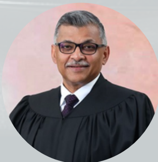
Chief Justice Sundaresh Menon (Supreme Court of Singapore)