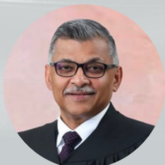
Chief Justice Sundaresh Menon (Supreme Court of Singapore)