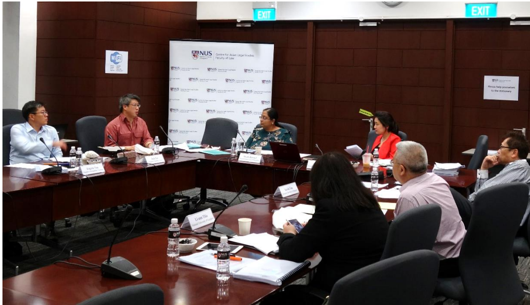
Participants engaging in discussions.