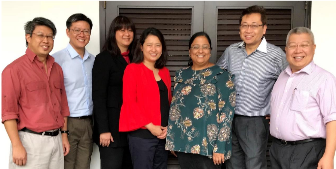
Participants of the 'Constitutional Change in Singapore: Reforming the Elected Presidency' Workshop.