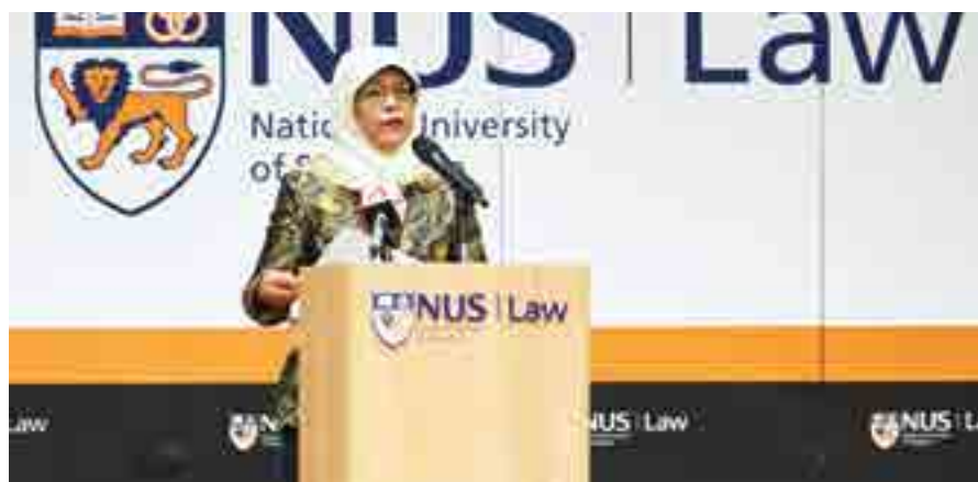
Madam Halimah Yacob delivering the opening address.