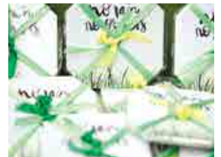
Commemorative tiles given at the event.