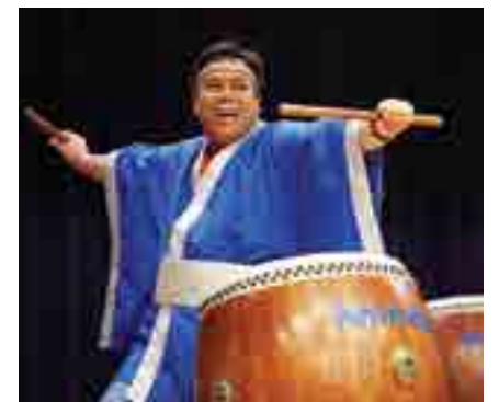
Performer from the MINDS troupe.

"I think it ties in very nicely with the opening of the pro bono centre, which is not just about helping unrepresented accused persons but also about enhancing access to justice by laypeople."