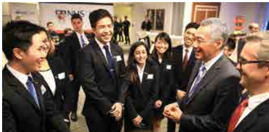
PM Lee chats with NUS Law student leaders.