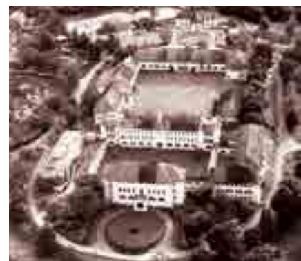
Aerial view of the campus when it was known as the University of Malaya, circa 1952

The campus on which the first Singaporean law students were admitted, sixty years ago, nestles at the edge of the Botanic Gardens, its whitewashed cloisters chosen from an Empire-wide architectural competition. Those students enrolled as colonial subjects in the new Department of Law of the University of Malaya; they graduated, four years later, from a Faculty of what would shortly be rechristened the University of Singapore, the country itself on the cusp of independence.