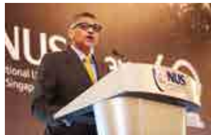
Chief Justice Sundaresh Menon '86