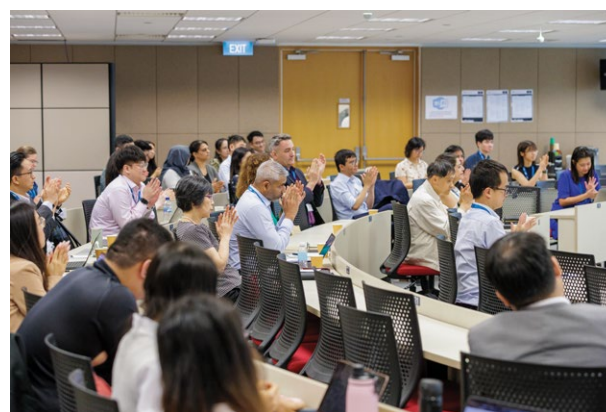
The inaugural International Forum on Asian Laws was held in August 2024, co-organised by the Centre for Asian Legal Studies at NUS Law and the Oxford Programme in Asian Laws at the University of Oxford's Law Faculty

Our students will have ample opportunities to broaden their academic networks, gain exposure to interdisciplinary approaches and develop deeper expertise in their chosen fields. The close integration between doctoral research and the activities of these centres ensures that NUS Law PhD students are well-positioned to produce impactful, globally relevant scholarship.