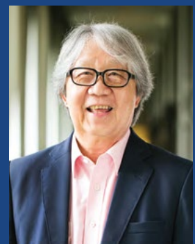
Professor Tommy Koh Class of 1961 Ambassador-at-Large Former Dean of NUS Law

"Our ambition is to continue to be the best law school in Asia and one of the best in the world. This is where civilisations of the world meet and co-mingle. We offer faculty and students a unique multicultural milieu for study, research and mutual learning."